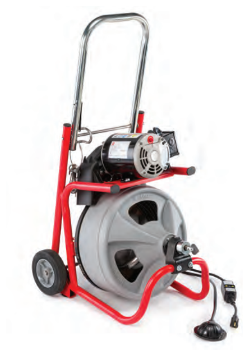
Model K-400 Machine Only