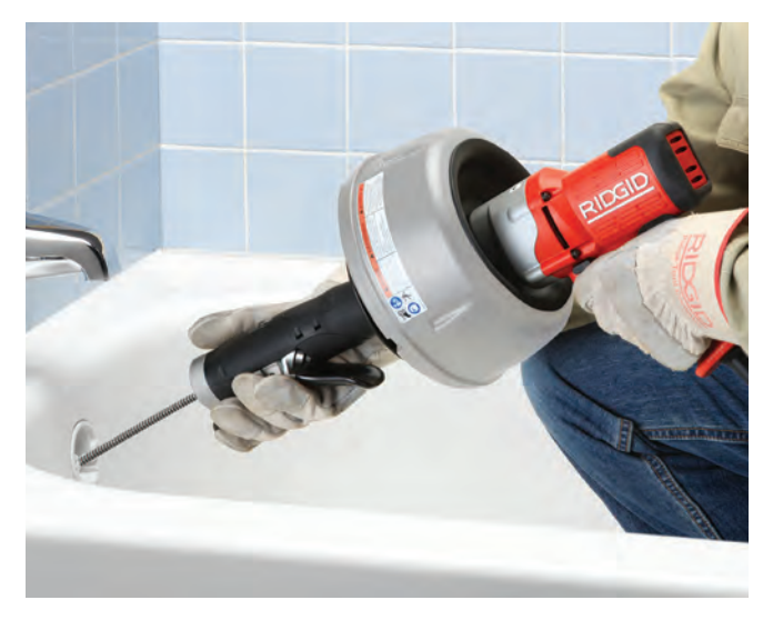
Model K-45AF quickly opens clogged tub lines. Advance and retrieve cable without reversing motor.