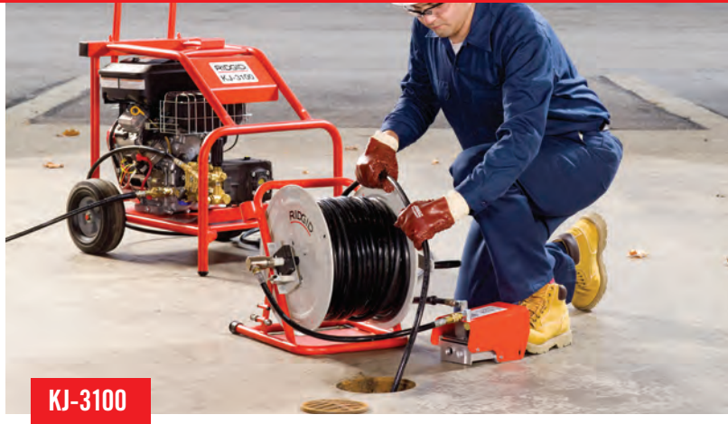
The 16 HP gas engine provides up to 3000 PSI to easily clear main lines from 2" to 10".