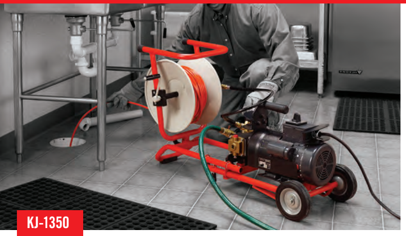
1350 \ \mbox{PSI} and a two-sided pulse action makes for fast effective cleaning of lines.