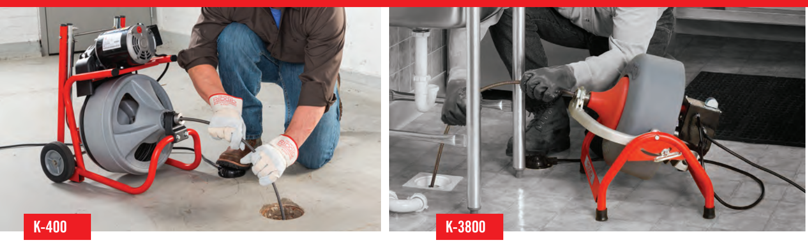
The integrated transport cart allows for easy movement to and from the job site.