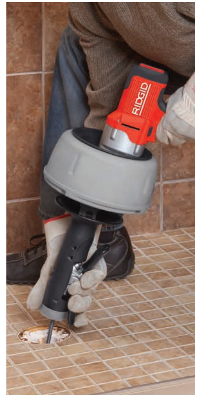
The 3/8" cable in Model K-45AF-5 and K-45AF-7 extends machine's capacity to 21/2" drain lines.

^{\ast} 230V units equipped with CEE 7/17 Euro plug.