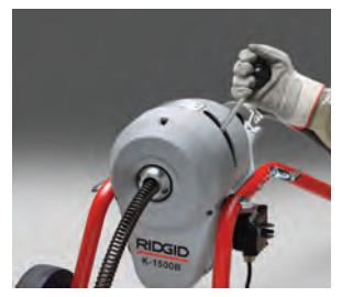
Engage clutch, cable spins.