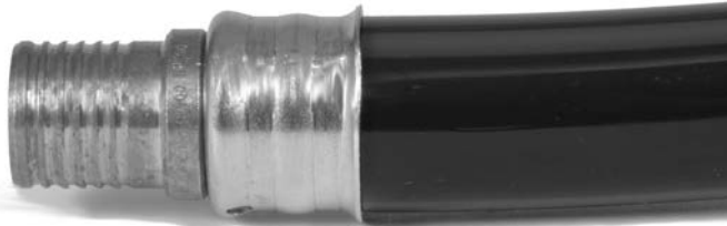
Figure 3 – Completed Pressed Fitting

PureFlow® is a registered trademark of Viega®. Viega® is a registered trademark of Franz Viegeler II GmbH & Company