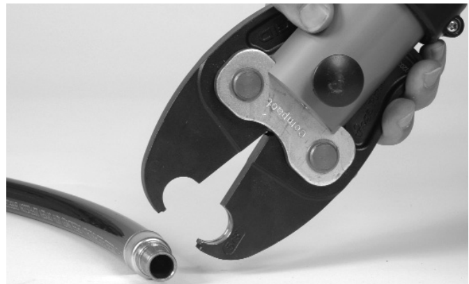
Figure 1 – Opening The Jaw